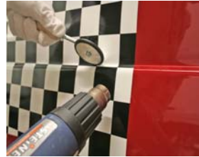
FIGURE 1 Use Roller S for Post-Application Finishing to Help Prevent Lifting

Note: If the graphics are printed with UV ink, please see Section C on page 11.